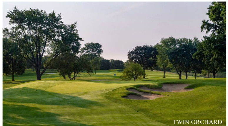
TWIN ORCHARD Drew Rogers will oversee a golf course renovation at Twin Orchard in Chicago

Additional amenities are also being designed to accompany the renovated course, including four new pickleball courts.