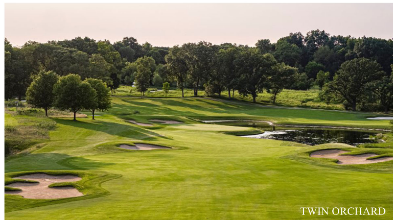
TWIN ORCHARD Bunkers will be reshaped, installed with liner from Better Billy Bunker, and filled in with white sand